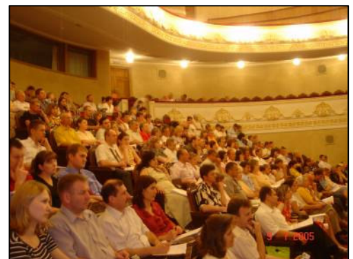
FamilyLife conference in Kiev. Ukraine has one of the most mature FamilyLife movements in the world.